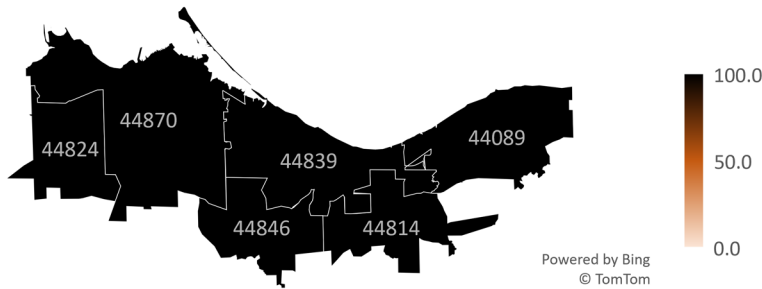
Incidence Rate per Zip Code January 23 - January 29